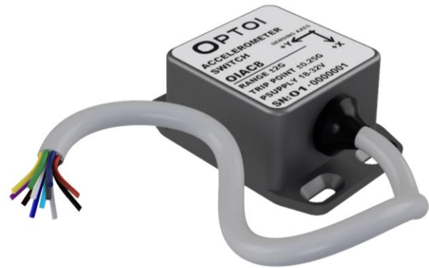
Images are for illustration purpose only and may not represent exactly the product in all the details

The internal protection circuits make these accelerometers electrically robust to withstand overvoltage and outputs lines overload.